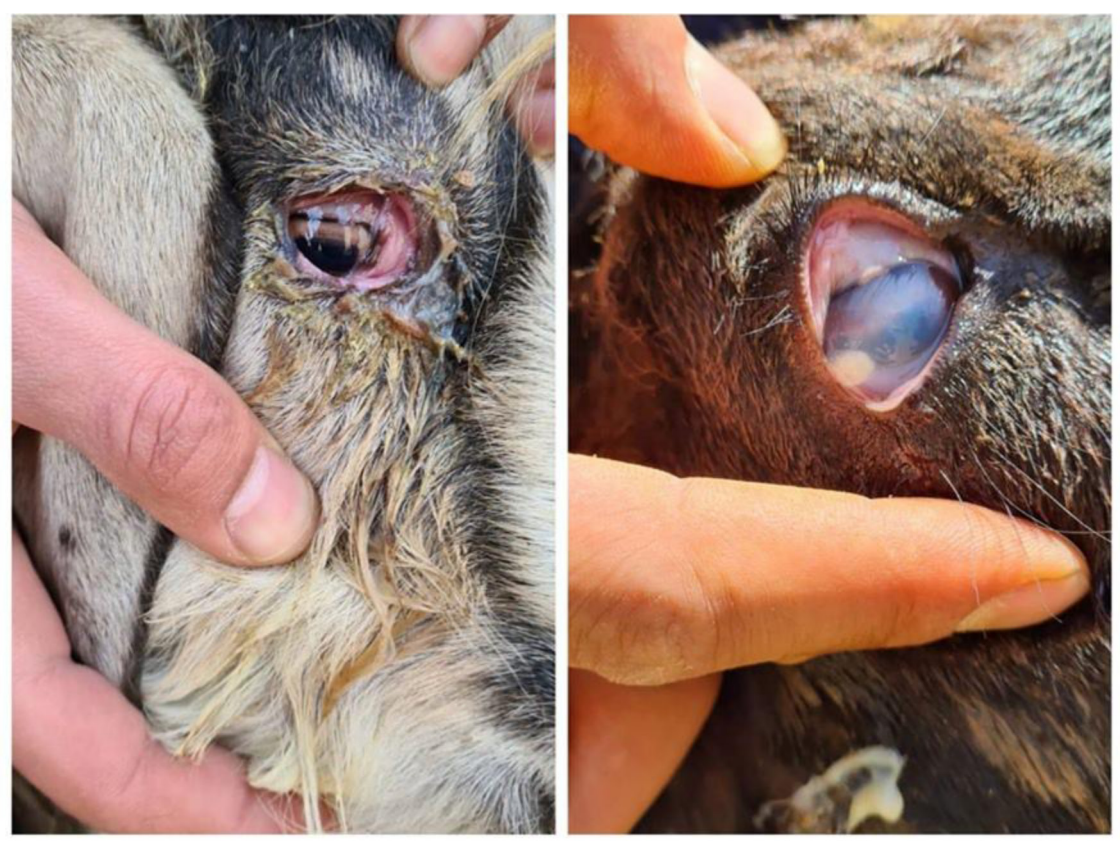
Fig. 1. Sheep with IKC findings after clinical examination (left: Stage 3 IKC, right: Stage 4 IKC).